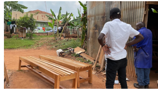
The waiting room chairs nicely done