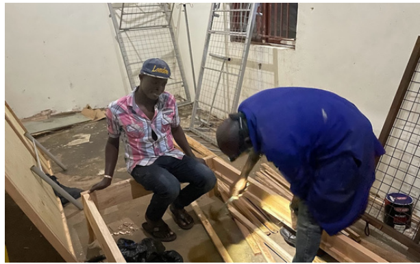
The carpenter partitioning the medical center