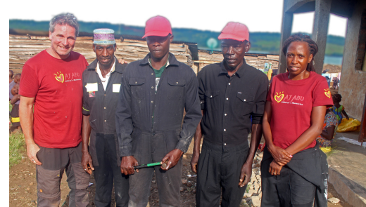
The founders and a team of dedicated workers