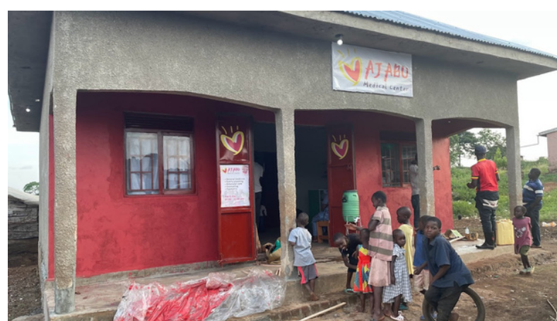
Ajabu Medical center on 2. july!