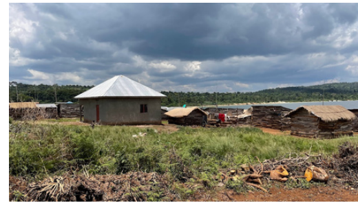
Acquiring the building for the medical center, 2022