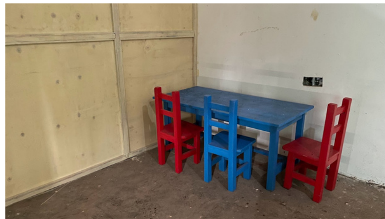
The children's waiting area