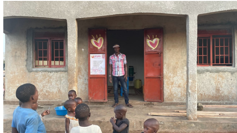
The building yet to be painted.