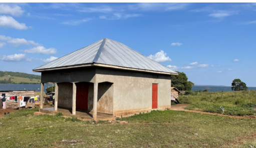
The proposed building