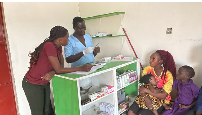
Patients waiting for their prescription medicine at the pharmacy .