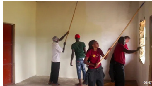
Start of renovations, 2022