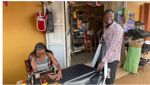
Everyone joined in to have the medical center ready for opening this summer