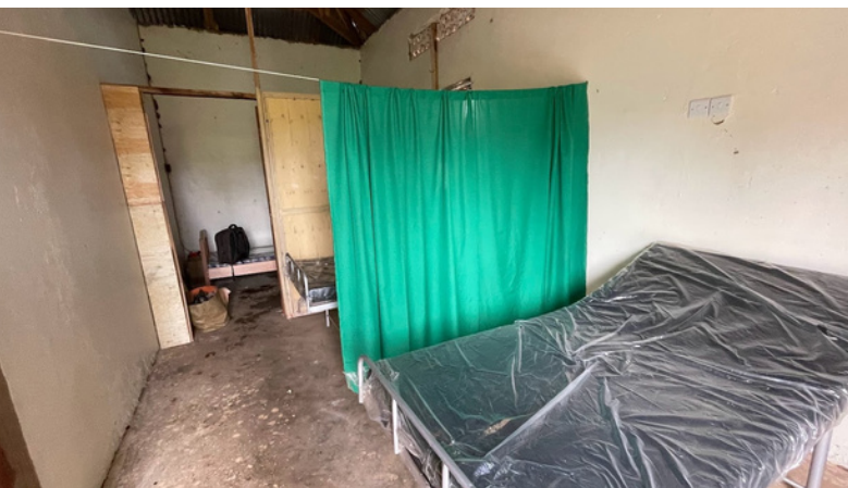
Setting up the admission rooms