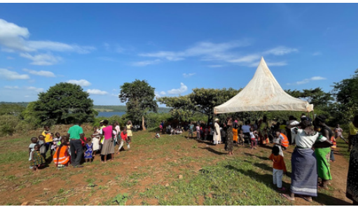
The medical outreach 2022