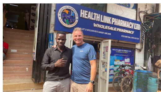
Partnering with a pharmacy to supply the medicines to the medical center