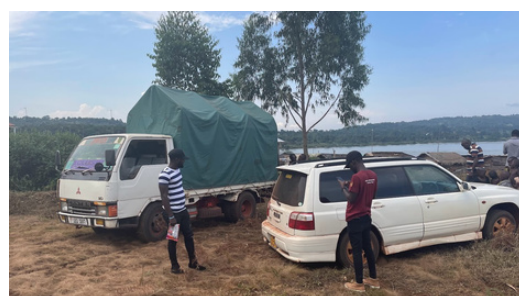
Finally we arrived Bubwa after 5 hours...