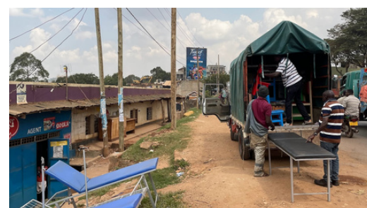
Picking up the equipments for the medical center