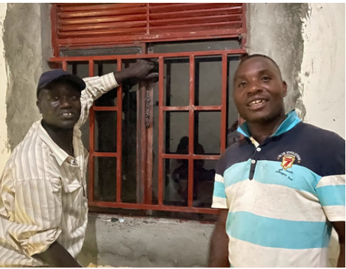
The builders installing windows