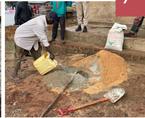
More work done by the builders