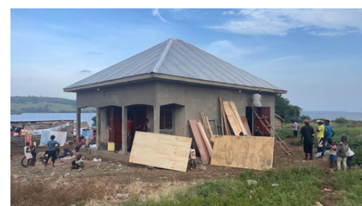
Starting the work on 30. june